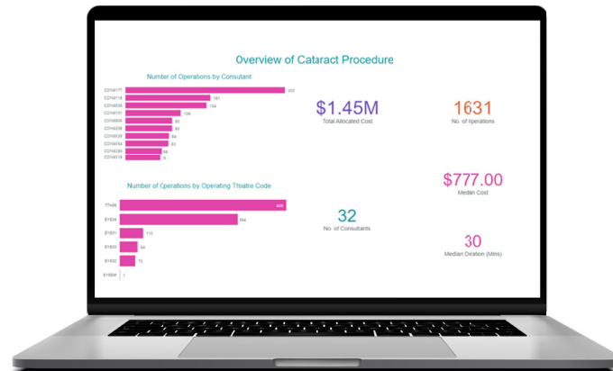
DRG deep dive into a cataract procedure showing total activity and cost by clinician.