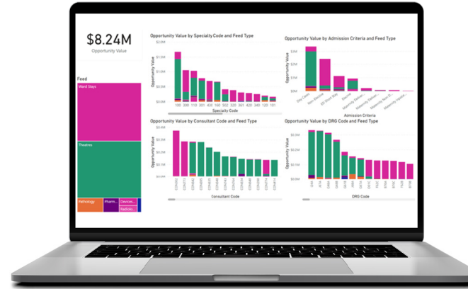
Overview of where greatest opportunity lies shown at different level of analysis.