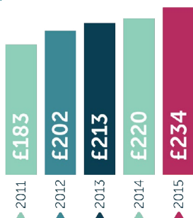
Group Turnover (Millions)

The Group has achieved an unbroken 14-year track record of growth and the company continued to expand and evolve in 2015.